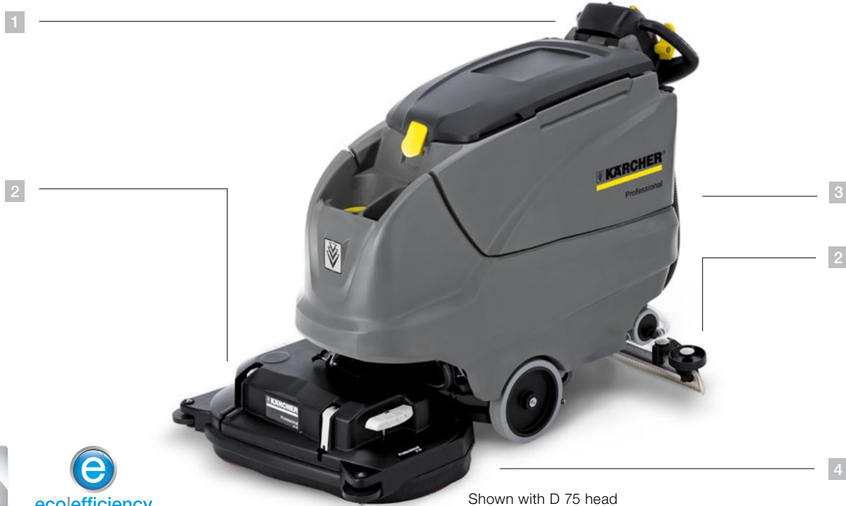
Shown with D 75 head

With a robust and maintenance-friendly brush head, the B 80 is available with roller or disc brushes in 22", 26" and 30" working widths. Equipped with KIK, a new 4-color display and automatic lowering and lifting of the cleaning head and squeegee, cleaning large areas is now easier.