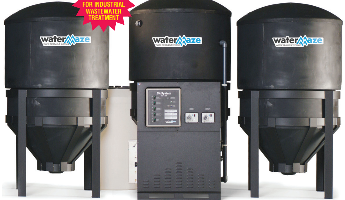
Stage 1: CLT-600 for enhanced bio-digestion

■ Proprietary BioStax 1800 Microbial Solution uses time-sequenced aeration of bacteria to control odor and create degradation of Total Petroleum Hydrocarbons (TPH), herbicides, insecticides and pesticides (HIPs). BioStax microbes are certified by the American Type Culture Collection (ATCC) as gram positive, pathogen-free, Class 1 organisms. The microbes effectiveness is further enhanced by the simultaneous injection of the Water Maze's BioNutrient solution.